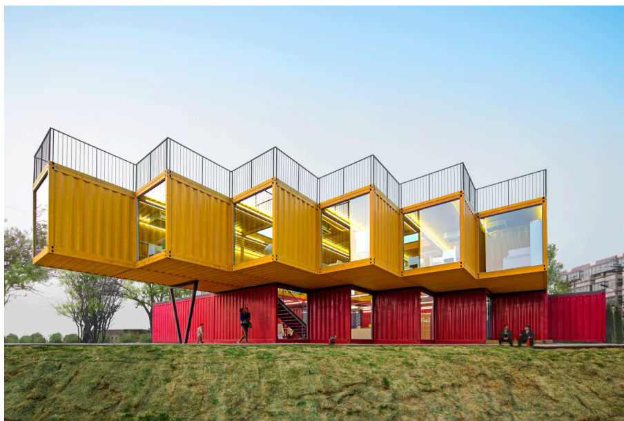
Pic. 2. Container Stack Pavilion

overlap. The Container Stack Pavilion is a temporary structure that can be disassembled and moved to other locations [8].